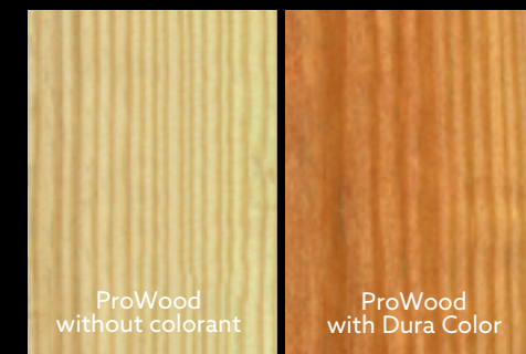
*color may vary per region